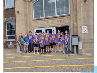
VOLUNTEERED AT EAU CLAIRE SCHOOL DISTRICT OFFICE