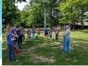
VOLUNTEERED AT CHIPPEWA VALLEY MUSEUM