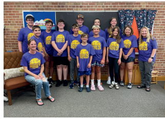
VOLUNTEERED AT ST. JOHN'S PRESCHOOL