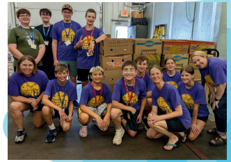
VOLUNTEERED AT ST. FRANCIS FOOD PANTRY